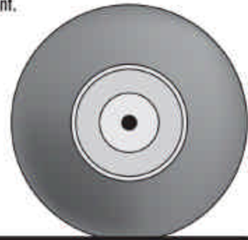
CATPASS Wilderness Tire