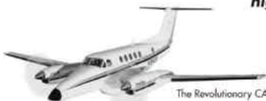
The Revolutionary CATPASS 250

What better way to gain the advantages of a high-flotation gear system at a fraction of the cost?